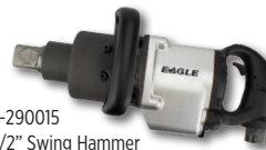
2S-290015 1-1/2" Swing Hammer