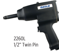
2260L 1/2" Twin Pin