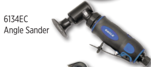
6134EC Angle Sander