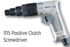
1115 Positive Clutch Screwdriver