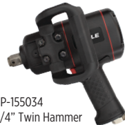
2P-155034 3/4" Twin Hammer