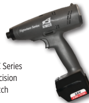
SPC Series Precision Clutch