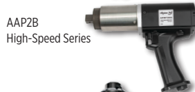
AAP2B High-Speed Series