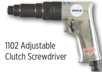
1102 Adjustable Clutch Screwdriver