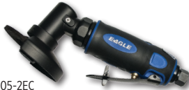
5205-2EC Angle Grinder