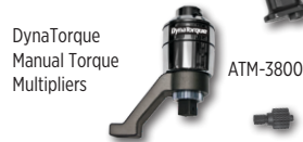
DynaTorque Manual Torque Multipliers ATM-3800