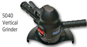
5040 Vertical Grinder