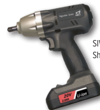
SIW Series Shut-off Impact