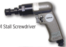
1101 Stall Screwdriver