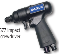
1577 Impact Screwdriver